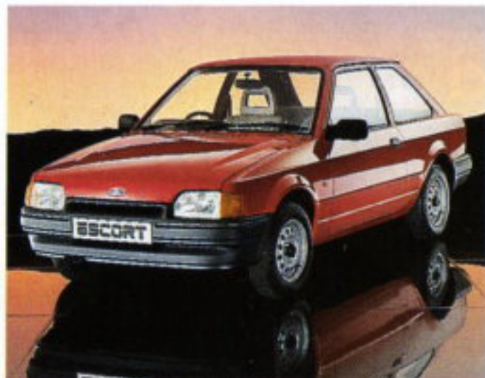
... the Escort Popular from £4,921*