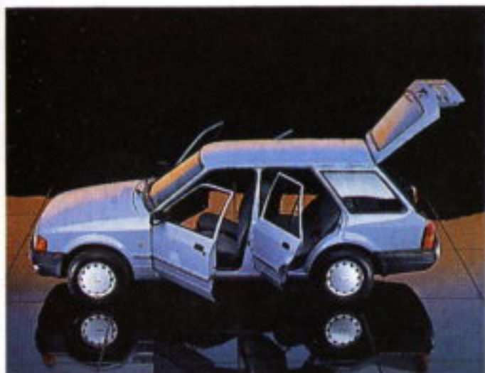
... Escort Estate from £5,373* Option fitted at extra cost: Rear seat belt.

Turn the page and we'll tell you more — more about the cars that prove, 'Nothing succeeds like success...'