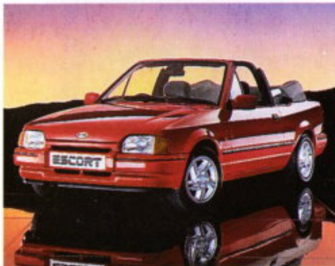
... Escort Cabriolet XR3i from £9,817* Options fitted at extra cost: Electric aerial and alloy wheels.