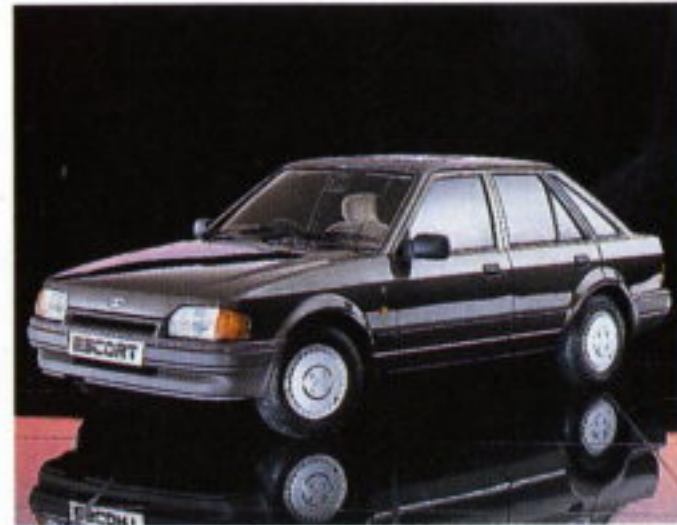
... Escort Ghia from £7,554* Option fitted at extra cost: Metallic paint. *Includes Car Tax and VAT.