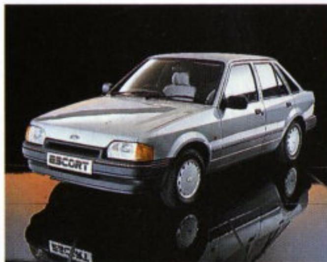
... Escort L from £5,930*

Options fitted at extra cost: Rear seat belts, metallic paint.