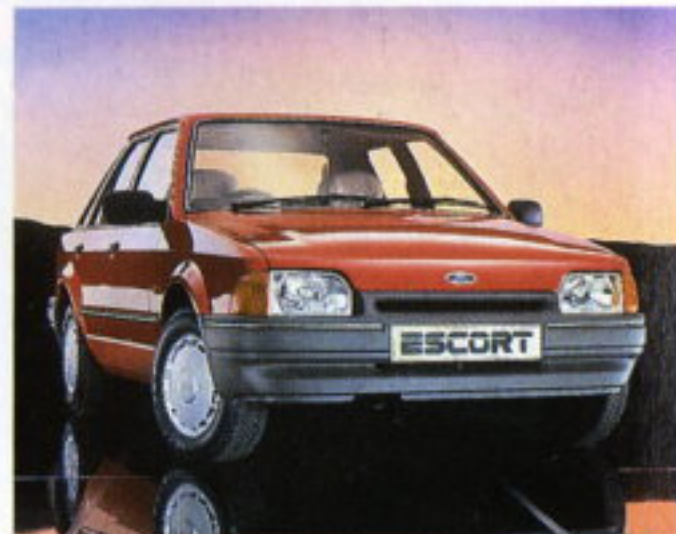
... Escort GL from £6,919*

Options fitted at extra cost: Rear seat belts, metallic paint.