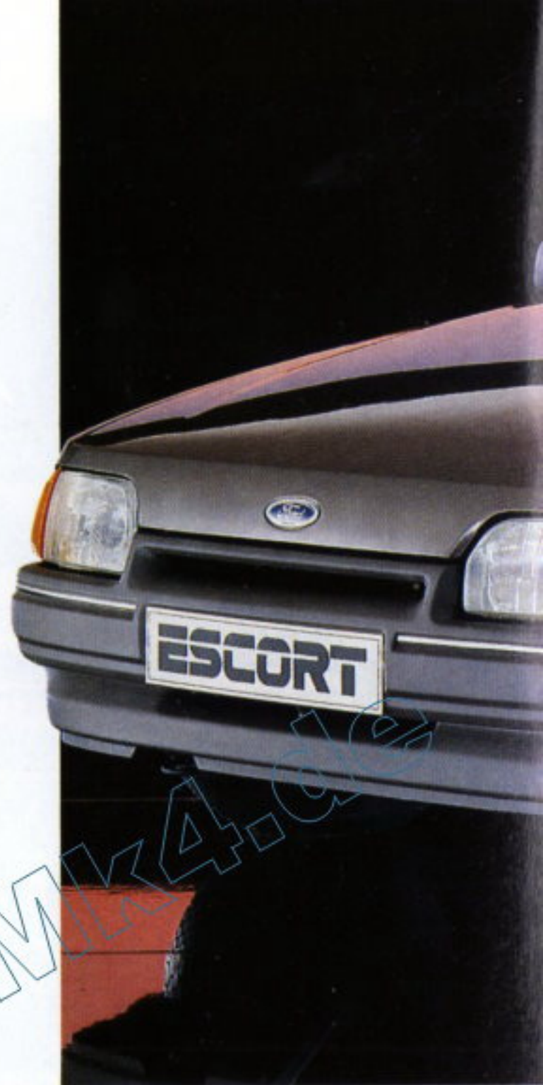
The new Ford Escort 1.4 Ghia

□ Government fuel economy figures: Ford Escort 1.6 diesel, 5-speed: mpg (L/100 km) constant 56 mph (90 kmh) 70.6 (4.0), constant 75 mph (120 kmh) 48.7 (5.8), urban driving 48.7 (5.8).